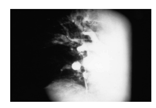
Figure 2. Distal occlusions of the pulmonary artery branches.

be administered. The use of diuretics, digoxin or vasodilators is not recommended unless strictly necessary. Treatment of severe CTEPH is essentially surgical (thromboendarterectomy-TEA). For extreme situations the ultimate treatment is lung transplantation. When pulmonary vessel obstruction is proximal, as shown in figure 1, surgical TEA is possible but it may be difficult when distal branches of the pulmonary vascular tree are involved (Fig. 2).